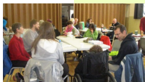
Walk 2017—Enjoying delicious Pizza and scrumptious desserts after the Walk.