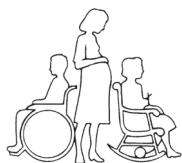
K-W Right to Life

215 Lancaster St. W. Kitchener, ON N2H 4T9